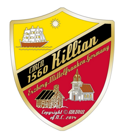
Killian Lapel Pin

Killian Lapel Pin: This is a lapel pin everyone will want.